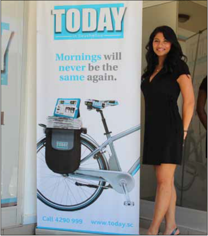
She spends more time in Seychelles and hopes to take her career further